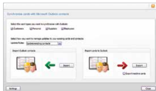
Effectively manage your clients