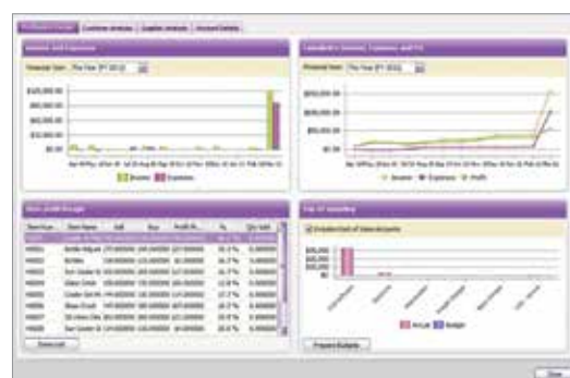
Quickly view your financial position