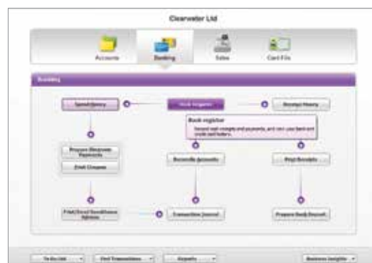
Quick assistance with Field Help